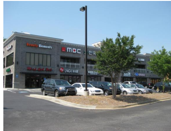
A relatively new development within the study area