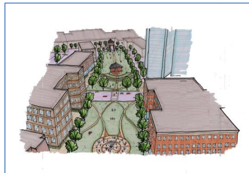
Drawing from the Conceptual Master Plan