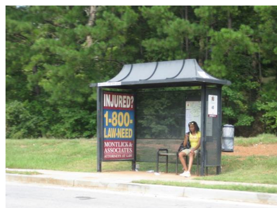
Bus stop within the study area

The LCI program has several goals that ultimately lend themselves to developing a network of activity centers and corridors in the region that are multi-modal and accommodating to people of all ages and backgrounds. The recommendations of the study have been vetted against these goals and ultimately work to promote them. The following section clarifies those guiding values of the study recommendations that will help promote ARC LCI goals as implementation occurs.