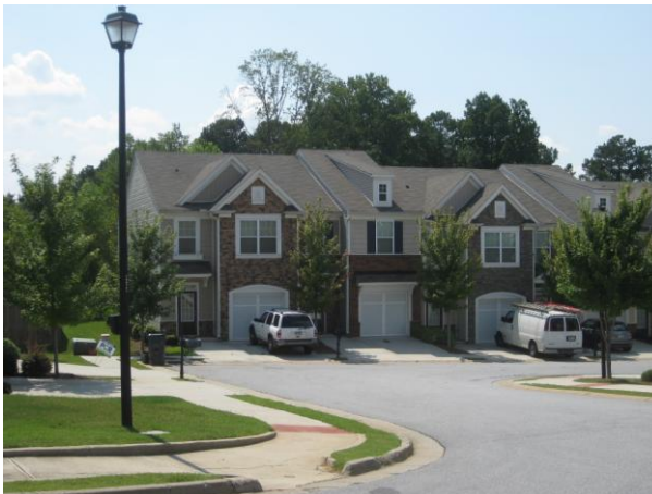
Housing in the study area