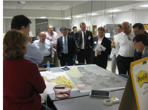
Group Discussion at the Community Workshop

Lays out general, economic development, and funding strategies for achieving the vision for the study area; culminates with a short and long term action plan with specific projects listed for regional funding.